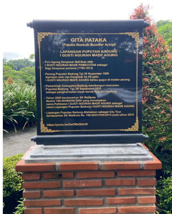
Figure 2. Puputan Badung monument called Gita Pataka near Puputan Badung Square