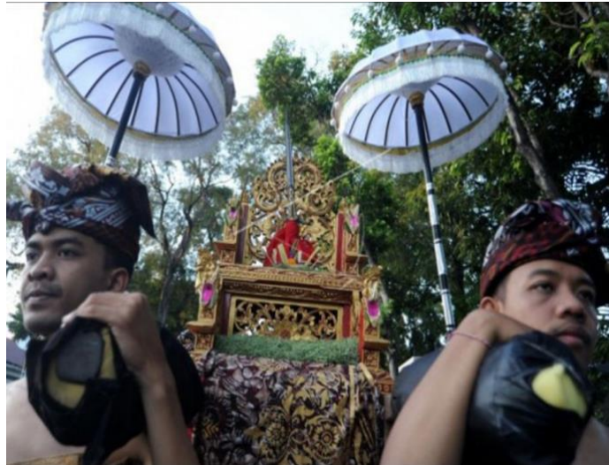
Figure 3. Puputan Badung annual festival 2019