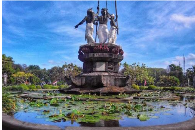
Figure 1. Puputan Badung statue at the heart of Denpasar City

16,902 foreign tourists and domestic tourists. as many as 21,445 people. The amount of tourist interest to visit and find out what destinations are in the city tours of Denpasar City shows that the development of the Denpasar Heritage city tours concept which was launched by the Mayor of Denpasar, namely IB Rai Dharmawijaya Mantra in 2015 went well.