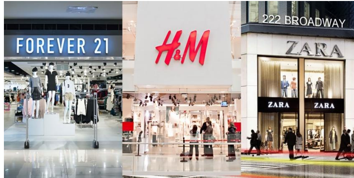
Figure 1. Fast Fashion outlets

very fast pace and low prices, which maximize their sales through impulse buying [9]. Thus, consumers demand constant changes in the store which means that new product items must be offered frequently. Due to very little stock, or no availability at all, together with rapidly changing merchandise selections, fast fashion brands empower consumers to visit their stores more often and throw away their clothes more often [10].